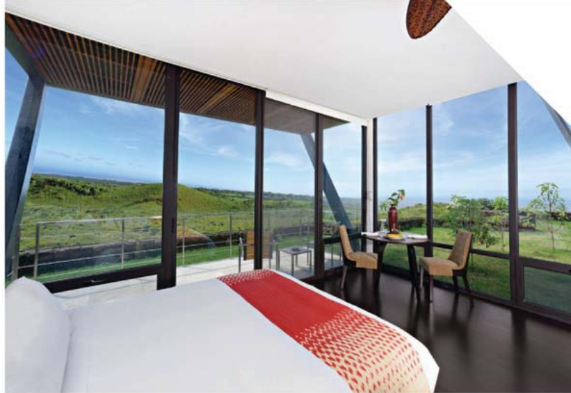
GALÁPAGOS GLAM Clockwise from top left: A vibrant Sally Lightfoot crab; a view into nature from a balcony room at the Pikaia Lodge; the pool suite's private plunge pool; a Galápagos Islands tortoise eases on down the road. Galápagos Islands' famous mascot, Lonesome George, was a tortoise who reportedly lived to be 102.

...CONTINUED Lightfoot crabs scampering over black lava rock. On another day, we made the sea voyage to the tiny island of Bartolomé, just off the larger island of Santiago, where we hiked the dramatic, rock-strewn lava fields. Later we climbed the 300-plus stairs to the top of Bartolomé and were rewarded with truly incredible views of the surrounding islands, as well as this area's answer to the Leaning Tower of Pisa, Pinnacle Rock. We later spotted penguins and sea lions while snorkeling, and a flock of frigates accompanied the yacht back to Santa Cruz. Our land day was devoted exclusively to the storied Galápagos Islands tortoises—we hiked around the highlands to watch them in their various habitats and took a trip to the Charles Darwin Research Station, which is home to a variety of species as well as the resting place of Lonesome George, a world-famous Pinta Island tortoise who lived out the last days of his reported 102 years there.