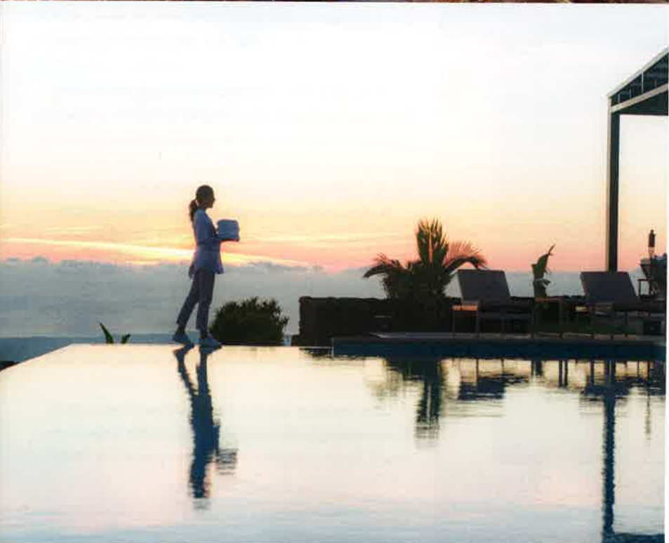
above The Galápagos is one of the world's best places for snorkeling and diving. left and below Sally Lightfoot crab and iguanas are among the wildlife here. bottom A panoramic view of the highlands can be seen from the sleek minimalist Infinity pool at Pikaia Lodge.

have evolved into a vertebrate some 500 million years ago, the 77-acre resort stays true to its roots as a model of sustainability and luxury. Notes founder and developer Herbert Frei: "I bought the land for the location, space, view and, most of all, the access to its beauty. It is hidden in a beautiful place, connected with nature and next to the Galápagos National Park."